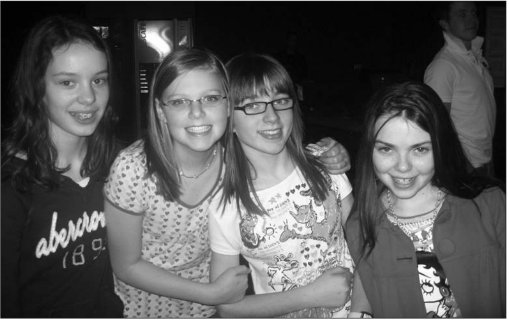
Above: The Tweenagers enjoyed a game of bowling and to visit to McDonalds on the 17th January. Below: Members of the Junior YF enjoying a Movie Night at the Church.