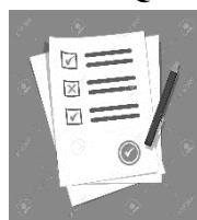
TABLE QUIZ FOR NIGERIA